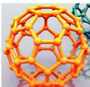
Figure 3: A schematic of Fullerene molecule.

It is non-magnetic, however, with some tricks it is possible to make it magnetic.